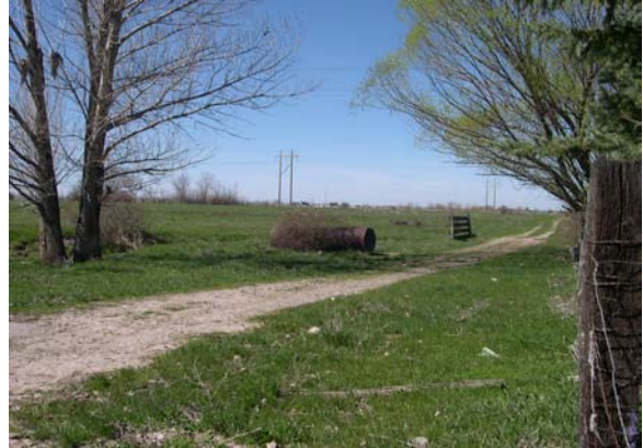
Open land near the City's southern boundary

This broad category identifies this vast amount of land as having the potential of being developed. It must be noted that although this land has the potential for development, the General Plan has, as a primary goal, the