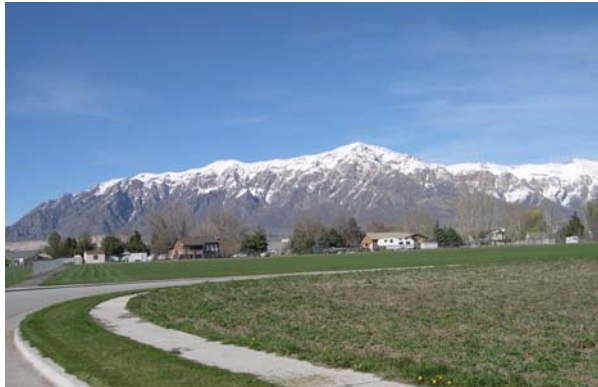
A northeast view from City Hall Park

Utah State Code Section 10-9a-401 requires “each municipality [to] prepare and adopt a comprehensive, long-range general plan for: a) present and future