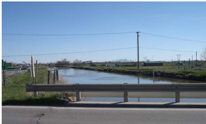
The Willard Canal

illegal dumping or run-off does not pollute these open waterways and ponds. Regulations and "Do Not Pollute" public awareness campaigns can assist in maintaining water quality in these open water resources.