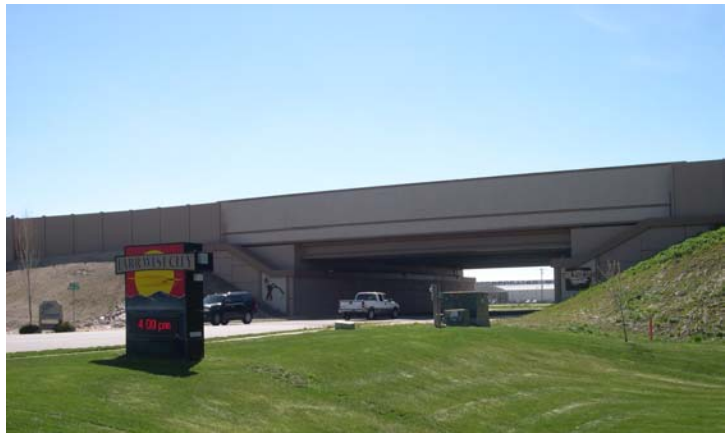
The Interstate 15 overpass at 1800 North Street near City Hall