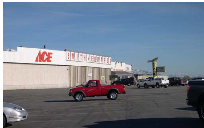
The well known Smith and Edwards

The earliest business in Farr West was built in 1862. It was called the Prairie House and was a tavern that primarily served travelers who were on their way to the gold mines in Montana. In 1869, the Union Pacific Railroad laid a line through the eastern part of Farr West, a line later called the Ogden