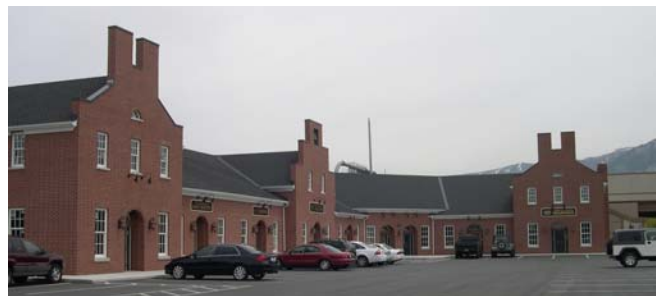
The Red Brick Store commercial building