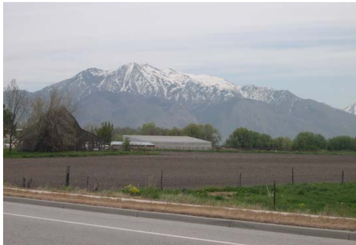
Beautiful agricultural land off of 1800 North Street

This broad category identifies this vast amount of land as having the potential of being developed. It must be noted that although this land has the potential for development, the General Plan has, as a primary goal, the