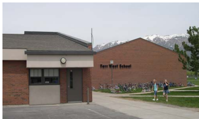
Farr West Elementary School