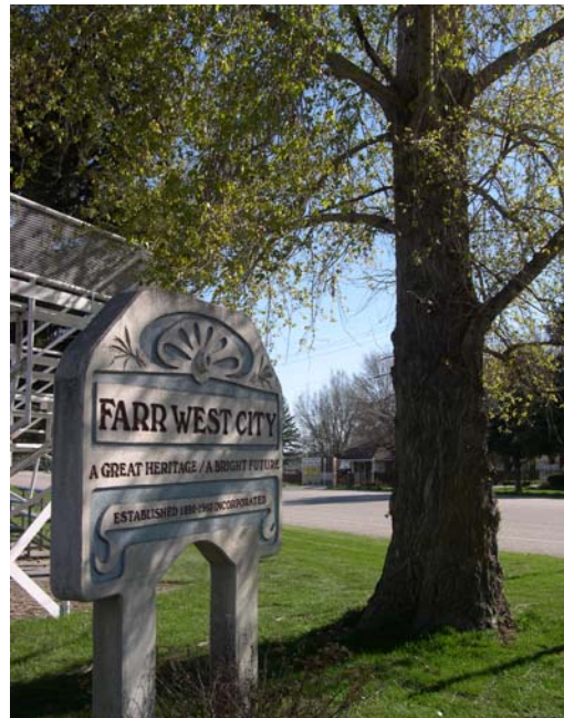
The entry feature of Farr West City Park

At the time this history was prepared, 1993, Farr West City boasted one of the nicest community parks in the county. This community park was not developed without great effort and planning. Property for the park was bought for a token payment of ten dollars from the Weber County School Board in 1939. Approximately four years later, arrangements were made with the Weber County commissioners to have the land leveled using county graders. Reported efforts were made to get grass established on the sandy soil. Only after a well was dug and a sprinkling system