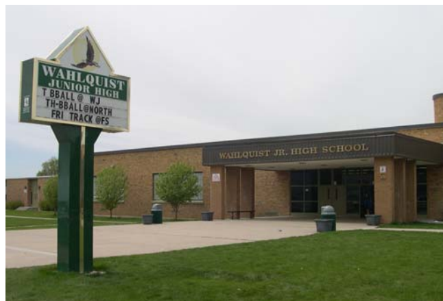
Wahlquist Junior High School