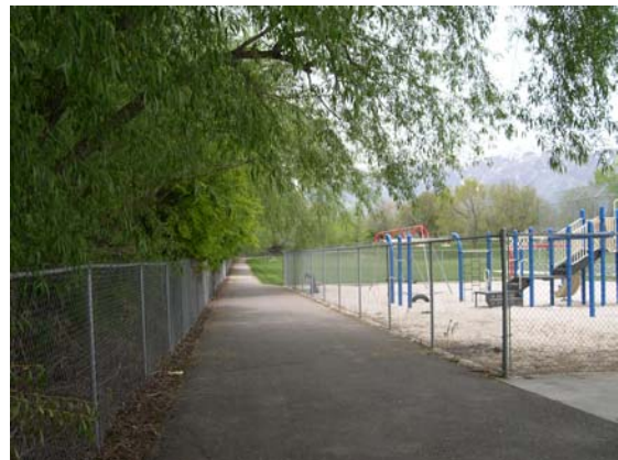
A walking path at Mountain View Park