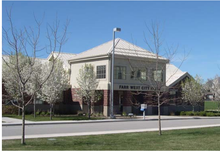
Farr West City Hall

This section addresses the various aspects and policies of public facilities, services and activities in the City including administration, public works and public safety.