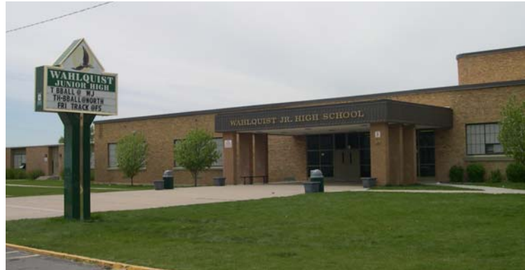
Wahlquist Junior High School

The growth of services in the community has significantly affected life in Farr West. In 1900, the first post office was established in Farr West. Rural free mail delivery