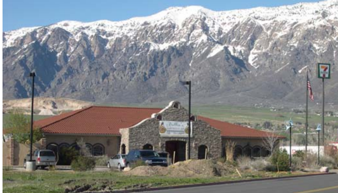
One of the City's restaurants off of 2700 North Street

Road improvements have had a significant impact on community development. The earliest unimproved roads were dusty in dry weather and filled with ruts and difficult to traverse in bad weather. Applying gravel to the roads improved