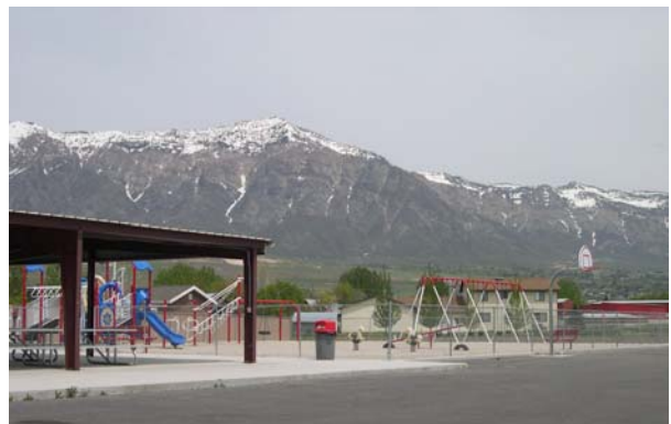
The facilities of 3300 North Park

Farr West Farms Park is a small park of open lawn.