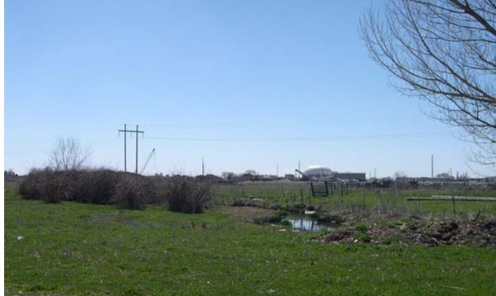
Four Mile Creek running along Farr West's southern boundary

impact the riparian area would give residents the opportunity to view wildlife and observe natural habitats, and would offer a place for outdoor education.