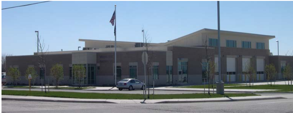
Weber Fire District Station 61 located in Farr West City

Police services in Farr West are provided by the Weber County Sheriff. Fire protection and emergency medical services are provided by the Weber Fire District. Station 61 is one of the newest fire stations of the Weber Fire District and is located on 2000 West Street in Farr West City.