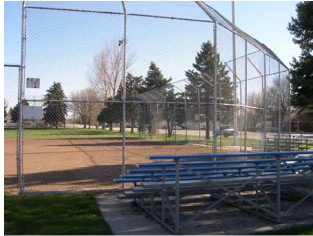
The ball field and bleachers at Farr West City Park