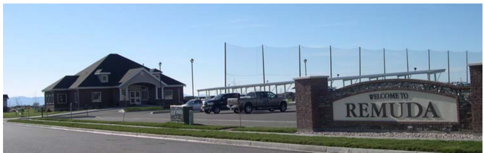
Remuda Golf Course, the City's largest private recreational area