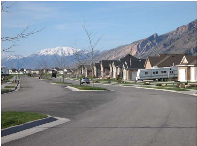
A residential street in the development around Remuda Golf Course

completed subdivisions are made up of homes that have been constructed in the past few years. Emphasizing the latter statement is the fact that in 2007, Farr West was rated one of the top ten fastest growing cities in Utah. There are subdivisions in Farr West that provide for equestrian use. Also, there is one manufactured-mobile home subdivision in the City.