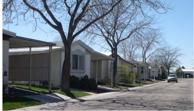
A view along a private road in Westgate Village, the mobile home community at the south end of town