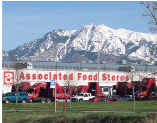
The Associated Food Stores warehouse