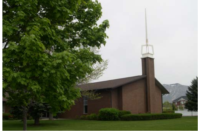
The LDS Stake Center near Farr West City Hall