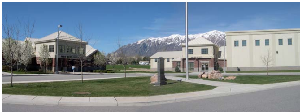
The Farr West City Hall Complex