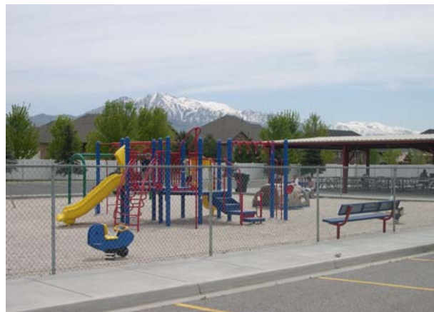
The playground near City Hall

In addition to the outdoor facilities that are part of the park at City Hall there is, adjacent to the park, a large indoor recreation center. This recreation center houses a gym, a weight room, exercise equipment and dressing rooms with showers and lockers.