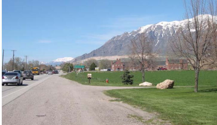
The 2000 West Street Corridor

Following are the general goals of Farr West City pertaining to transportation and circulation. Each general goal is accompanied by several specific goals listed below it.