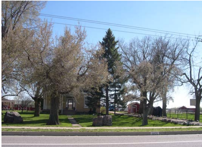
A picturesque residence on Farr West's 1800 North Street