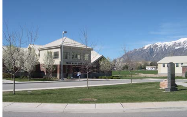
Farr West City Hall Complex

The General Plan of Farr West City is a policy document to provide for the present and future needs of the City. It is to guide growth and development within the City. It is to provide a broader context when looking at specifics regarding future land use and development. It is to