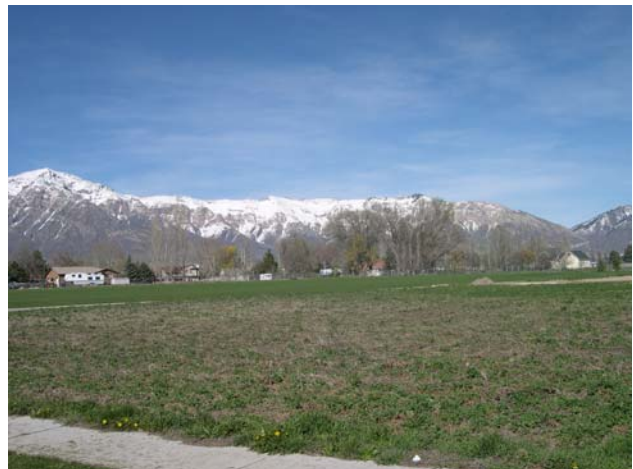
Open lawn behind the City Hall Complex

Farr West is located in the northwest section of Weber County in the state of Utah. It is situated between the cities of Pleasant View, Harrisville and Ogden to the east, Plain City to the west, Marriott-Slaterville to the south and Box Elder County to the north. The Wasatch Mountains, with their myriad of recreational uses, rise to the east. Ben Lomond Peak, in particular, is prominent in the backdrop of the City. To the west of the City is the northern arm of the Great Salt Lake and Willard Bay Reservoir.