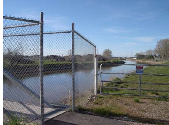
The Willard Canal at 3300 North Street