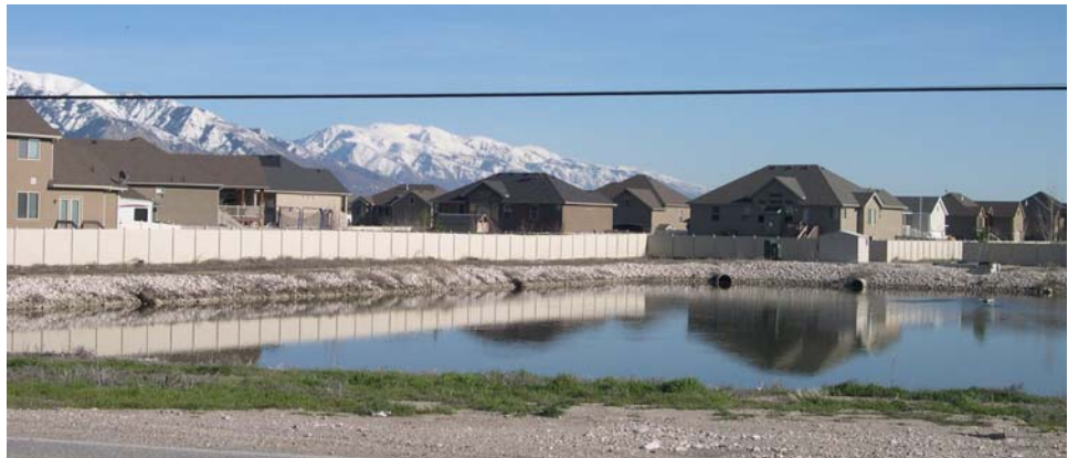
One of the City's open detention ponds