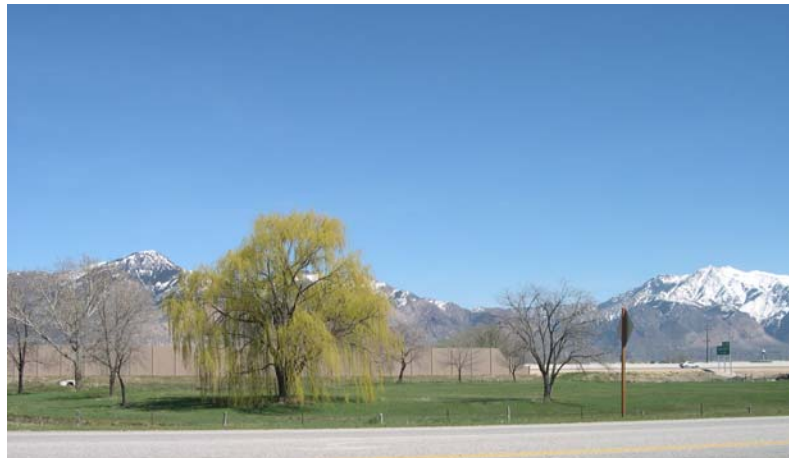
Open land along the City's 2000 West Street

Farr West City has few concerns regarding the current environmental conditions within the City. There are no known environmental hazards in the City's boundaries. There is, however, potential for environmentally related issues to