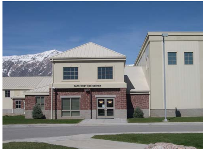
The Farr West City Recreation Center

Farr West has a traditional style of government with a Mayor and a five-person City Council. The City also has a Planning Commission made up of a Commission Chair and five Commissioners. City staff includes 6 full-time