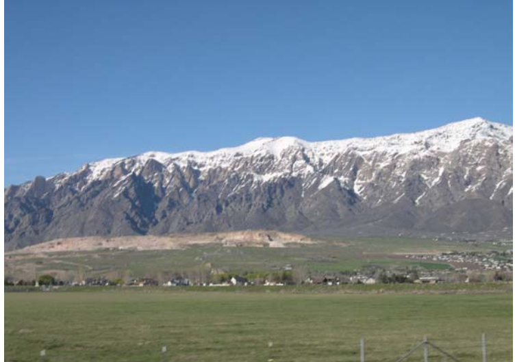
The Wasatch Mountains rising over a northeast section of the City

This section covers environmental issues of Farr West City. It is the intent of the City to maintain a high quality of life, health and safety for its residents through proper regulation in areas of air quality, water quality, land and soil maintenance and fire safety.