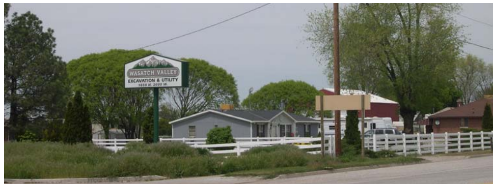
A typical view of the mixed use along 2000 West Street