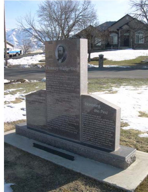
Historical monument honoring Lorin Farr, Chauncy West

Since World War II, most of the local small farms have gone out of business. Only a few large farms specializing in dairy or beef production remain in operation today. In the early 1990's, only one farm raised garden fruits and vegetables on a commercial basis.