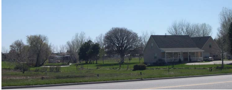
A beautiful larger residential lot along Farr West's 1800 North Street

of the collector and minor arterial roads of the City. Also in this category are more recently developed subdivisions with large lots that accommodate equestrian use.