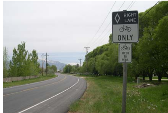
The designated bike lane along Higley Road

The current parks and trails of Farr West City are shown on Map 7.1 - Parks and Trails after the text of this section.