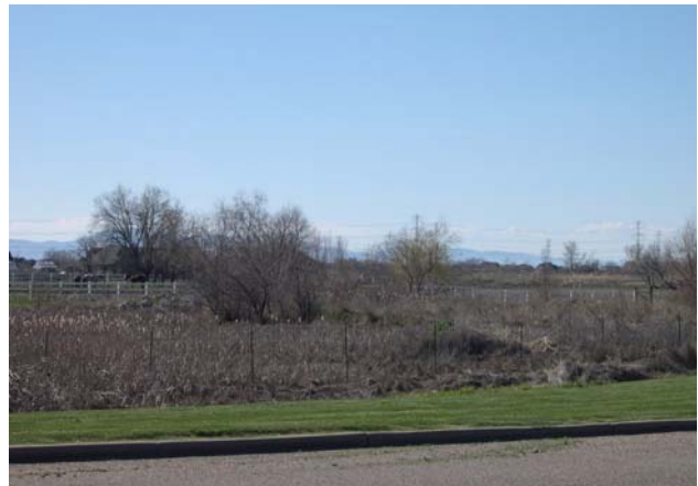
A view of the Farr West's wetlands