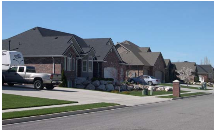
A typical residential neighborhood street of Farr West