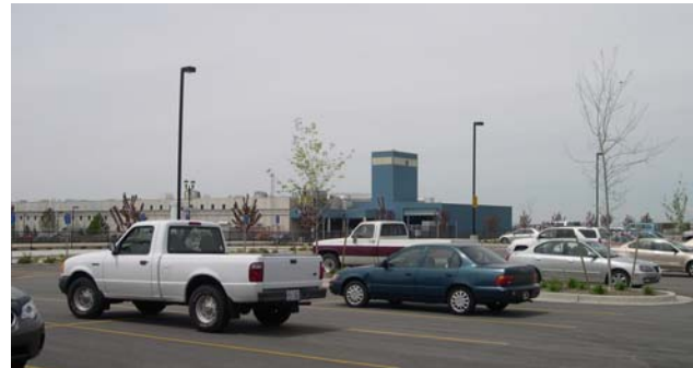
The park-and-ride lot at the Pleasant View Front Runner Station off of 2700 North Street

services and a park-and-ride parking lot adjacent to the City boundary at 2700 North Street near the Associated Foods complex. This route is currently