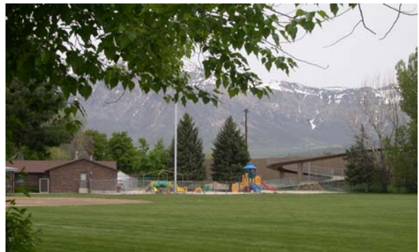
A view across the ball field at Farr West Park