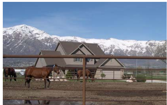
The equestrian oriented neighborhood of Heritage Ranch Drive