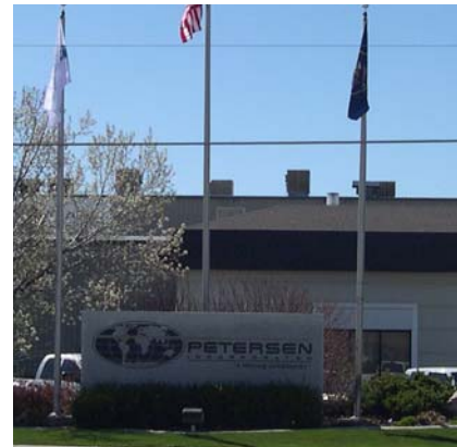
The Petersen Inc. main offices