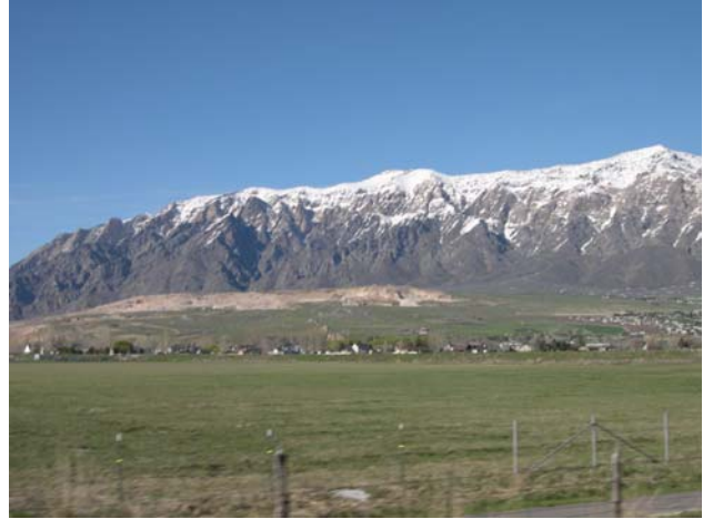
A view of the Wasatch Mountains rising above open land in the northern portion of the City

Farr West City is a rural community grown from an agricultural heritage where a hard day's work was required. There was an appreciation for the land, the open space and the opportunity of enjoying them through physical labor or recreation. Today, Farr West continues to value its land and open spaces and realizes that growth will continue. There is a strong desire to manage that growth responsibly, to continue providing for the needs of its long-time residents as well as its recently arrived and future residents.