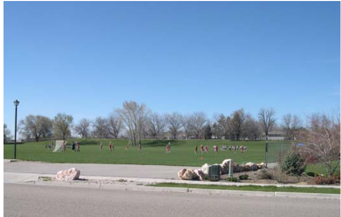
A girls lacrosse team enjoying the fields at Mountain View Park