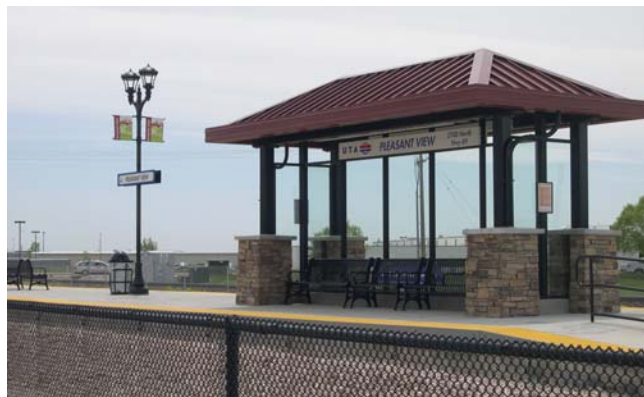
The Pleasant View Front Runner Station

identified as Route Number 613 and runs south towards Ogden from 2700 North Street. A second bus route, Route Number 685/630 runs north and south along Highway 89. This route is east of Farr West City.