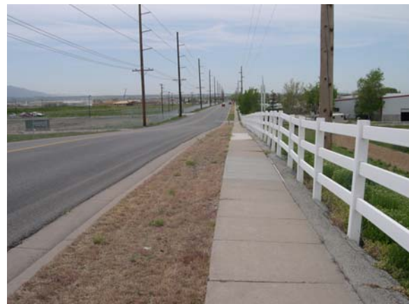
A view of 1200 West Street near Wahlquist Junior High School

The City is to prepare a Transportation Plan, which will become an appendix to this General Plan. The chief objective of the Transportation Plan will be to provide an outline for a safe, convenient and efficient system of sidewalks,