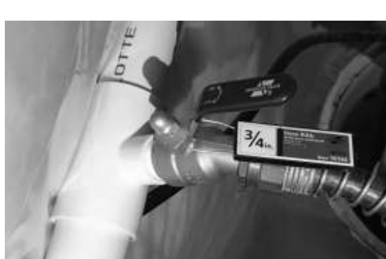
Shut off valve (about $4)

Valve to accommodate standard garden hose (about $9)